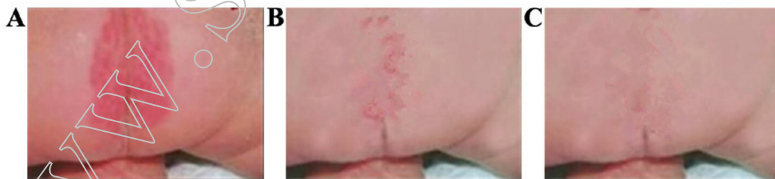
Figure 2. Images of an infant (severity grade I) pre- and post-treatment. (A) The symptoms of an infant (severity grade I) in group A before treatment; (B) the relieved symptoms of an infant (severity grade I) in group A 24 h after treatment; and (C) the healing of an infant (severity grade I) in Group A 5 days after treatment.

of stratum corneum, leading to gradual degeneration of the barrier function of epidermis, and as a result, fungi penetrated the skin and caused fungal infection. iii) Infant was of poor immunity and susceptible to diseases, thus the administra-